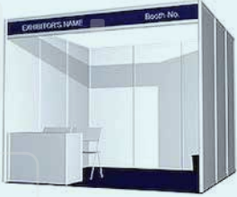
Shell Type (3m x 3m)

Bangladesh Exhibitions Pvt. Ltd, was established with the ambition to be a leading international exhibition organizer in Bangladesh. Bangladesh Exhibitions is manned by most experienced professionals who had been in the industry for more than decades and served the Industry in National and Regional Level. BEPL's initiatives range from policy advocacy, export promotion, trade fairs, mega events, training, seminars, technology missions, publications, etc. BEPL formed in 2018 has a membership of over 150 members and gradually striving forward with publications and events to create the largest networking platform to facilitate business between local and foreign companies.