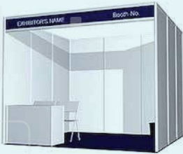
Octonorm Type (3m x 3m)