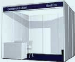
Octonorm Type (3m x 3m)