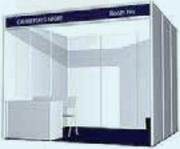
Octonorm Type (2.5 x 2.5)